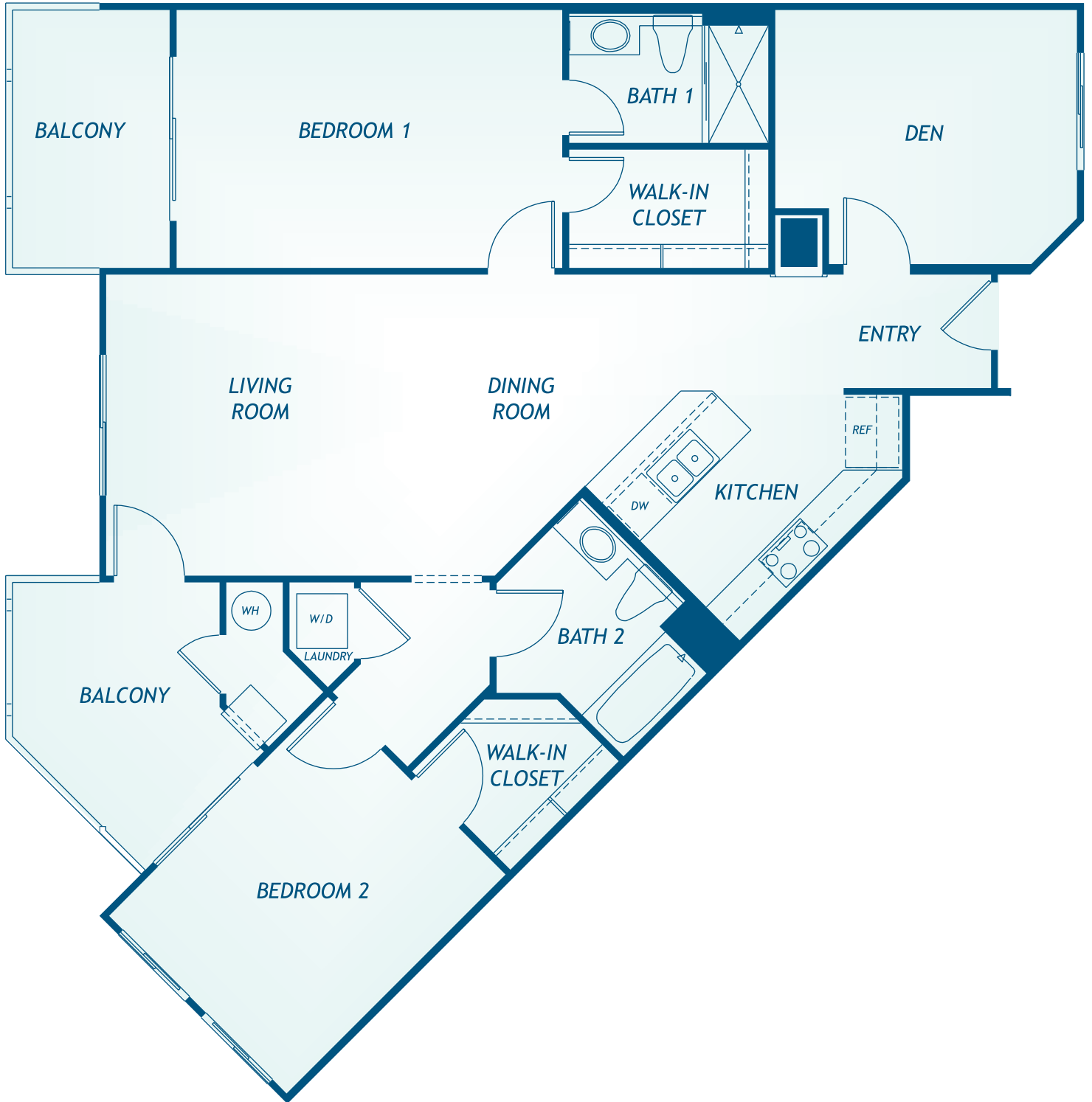
Plan A 1,243 Sq. Ft. 2 Bedrooms 2 Baths